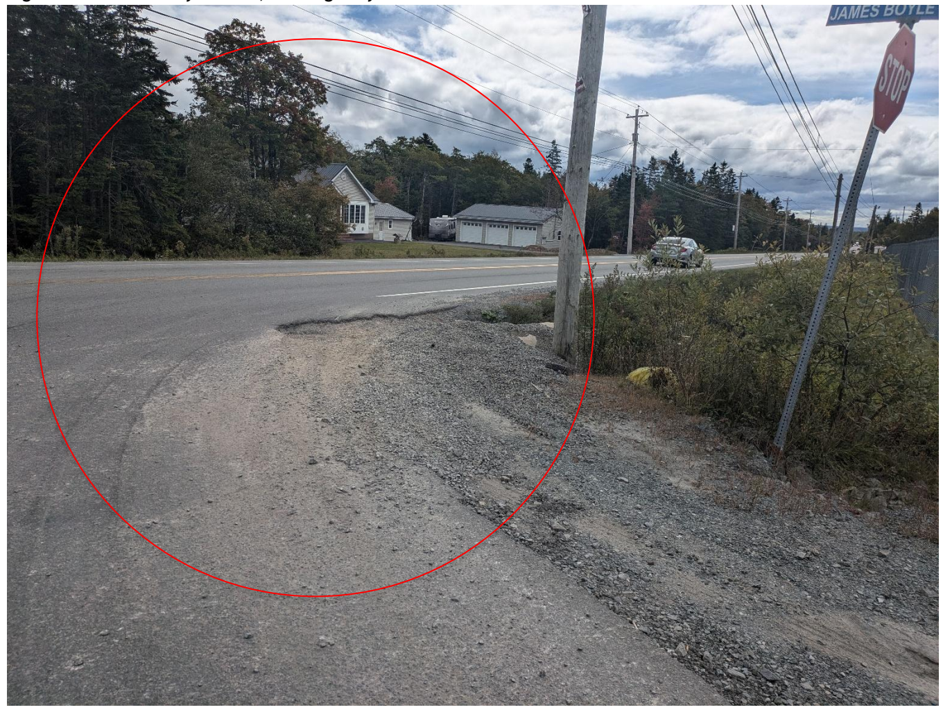
Figure 1.0 - James Boyle Drive, and Highway 1 intersection

meeting the business sent an email that expressed concerns about the danger of trucks navigating these intersections and the resulting damage to the shoulder.