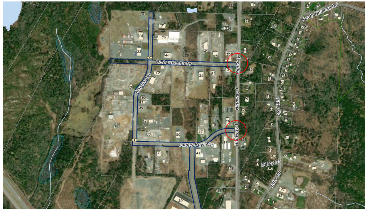
Figure 1.0 - Richard John Drive, James Boyle Drive, and Highway 1 intersections.

In response to this issue, Staff secured WSP to complete a vehicle swept path analysis (truck turning) for the two intersections along the Highway 1 in the Summer of 2024. WSP confirmed that large trucks are not able to navigate the intersections of Highway 1 and James Boyle Drive and Richard John Drive without tracking off the road surface and crossing the centre line of the roads. The Memo report from WSP is attached to this Staff Report.