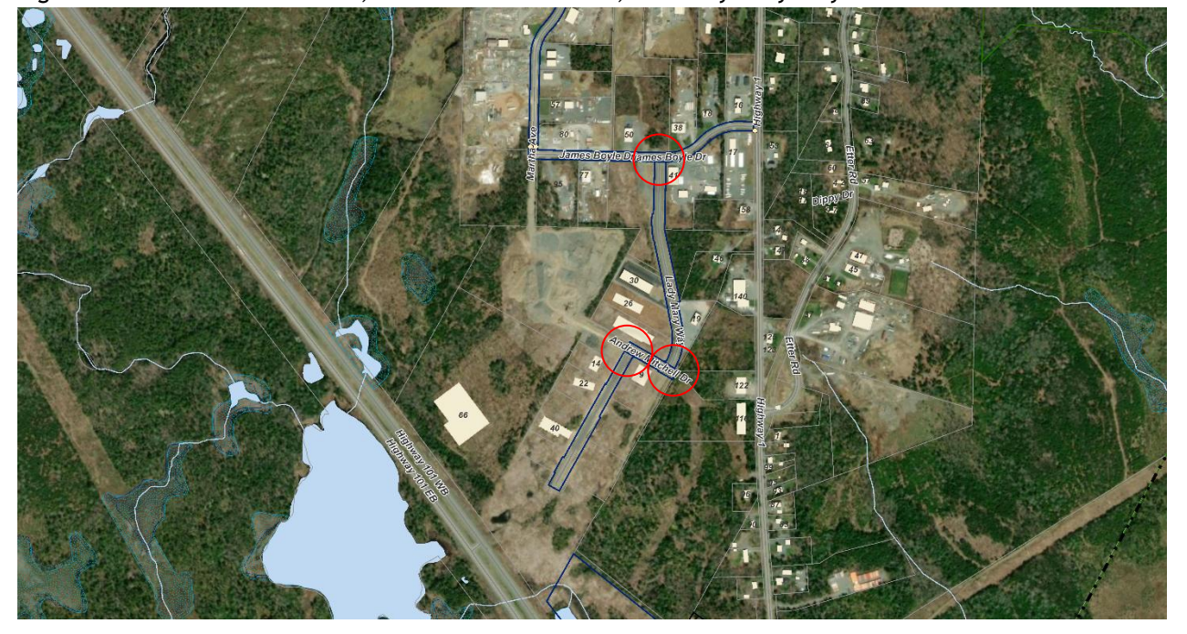
Figure 2.0 - Alicia Scott Avenue, Andrew Mitchell Drive, and Lady Mary Way

Division have confirmed with Strum Consulting that the current roads are built to design and municipal standard. However, Atlas has indicated with a swept path analysis (truck turning) that large trucks will be tracking over the road surface onto the gravel shoulder and may be impeded by road signs and guard rails. There is an opportunity if Council chooses to have these intersections examined and an analysis done to validate these concerns.