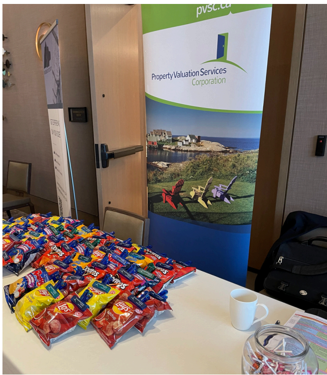
PVSC Booth at the AMANS spring conference.