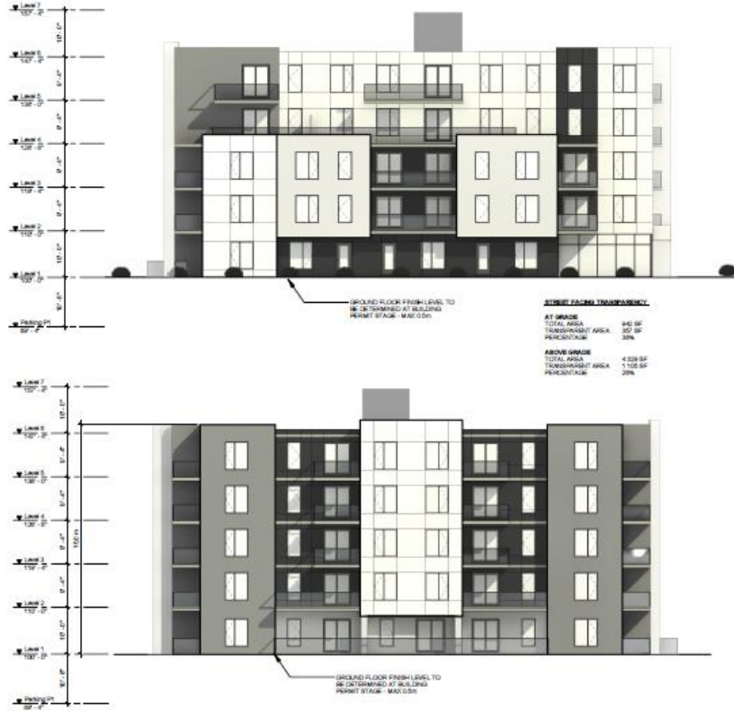
① B East Elevation 1/16" = 1'-0"