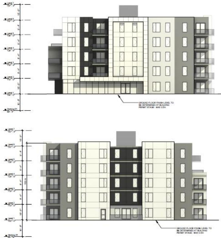
① B North Elevation 1/16" = 1'-0"