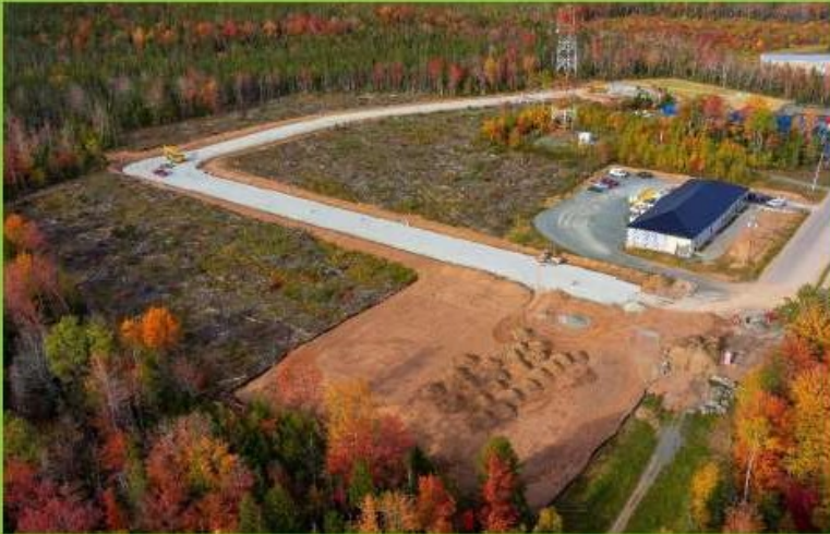
2022 Commercial Tax Rates

The Municipality of East Hants' commercial tax rate is competitive with its neighbors. Despite being slightly higher than HRM, East Hants commercial tax rate for locations with water and sewer services ($3.54 per $100 of assessment) is lower than the Town of Truro ($4.50 per $100 of assessment) and comparable to the Town of Stewiacke ($3.45 per $100 of assessment). As indicated in the five year compare, East Hants' commercial tax rate remains steady.